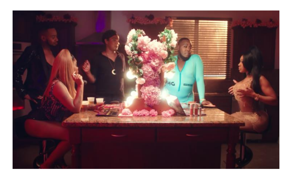
City Girls, "Jobs" Music Video, 02:38 (2020), Screenshot.

sexuality, regardless if they capitalize on it or not. It is through the support of queer friendships that these Black women come into their own erotic sovereignty, and they celebrate that in the form of a song and music video with their friend, Santana.