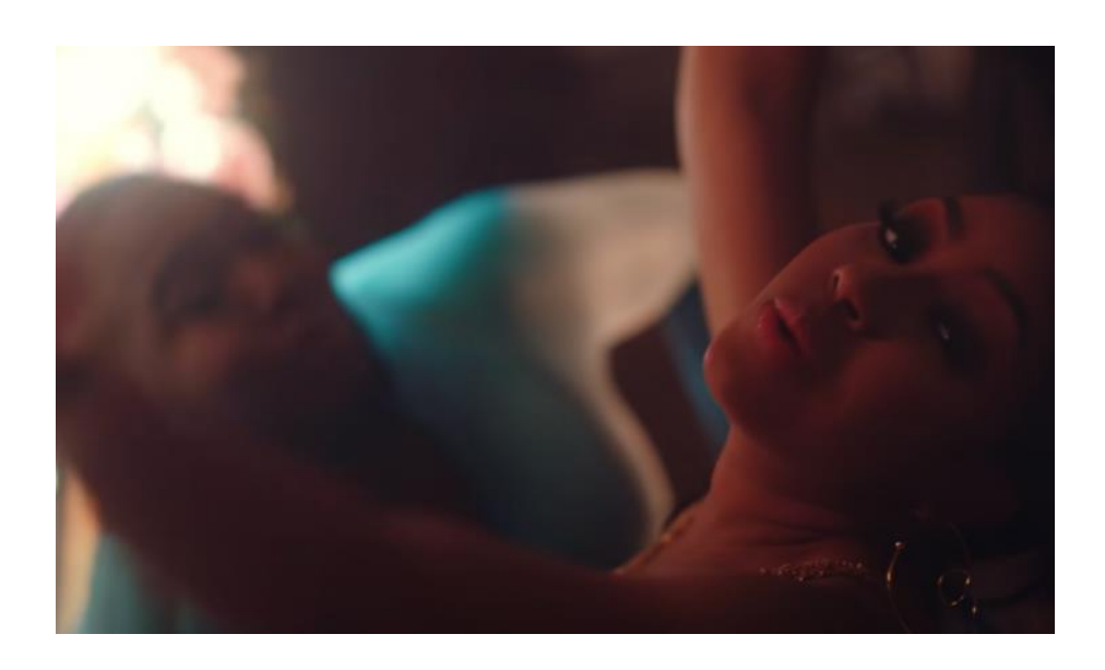
City Girls, "Jobs" Music Video, 03:27 (2020), Screenshot.