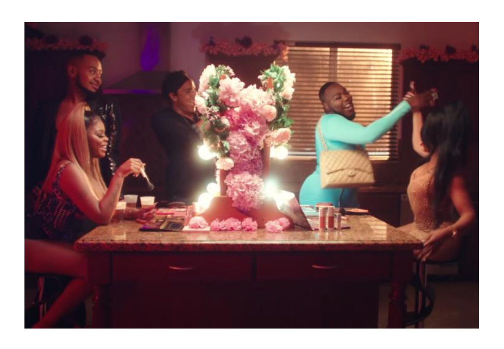
City Girls, "Jobs" Music Video, 02:52 (2020), Screenshot.