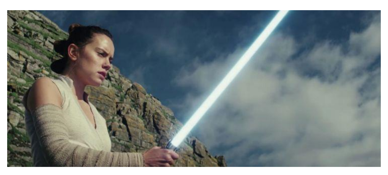
Rey ignites Luke Skywalker's lightsaber on Ahch-To. Screenshot image from The Last Jedi trailer (https://www.youtube.com/watch?v=Q0CbN8sfihY) at 00m 25s.

The features of Rey's journey differ according to the theories laid out by Vogler, Murdock, and others, yet, the overarching aims of a hero's journey are twofold: 1) personal growth and self-discovery, and 2) saving society. The latter aim is typically a byproduct of traditional hero's quest for self-discovery. Crossing a threshold, overcoming tests, attaining a reward, and crossing back over the threshold require heroes to unify their souls and bring about change within society. The order in which the hero undertakes these two quests reveals his or her character and whether he or she is a traditional Campbellian hero or a contemporary one representing modern society. Rey redefines existing hero theories and with the release of The Last Jedi , audiences will be able to see the result of her trajectory.