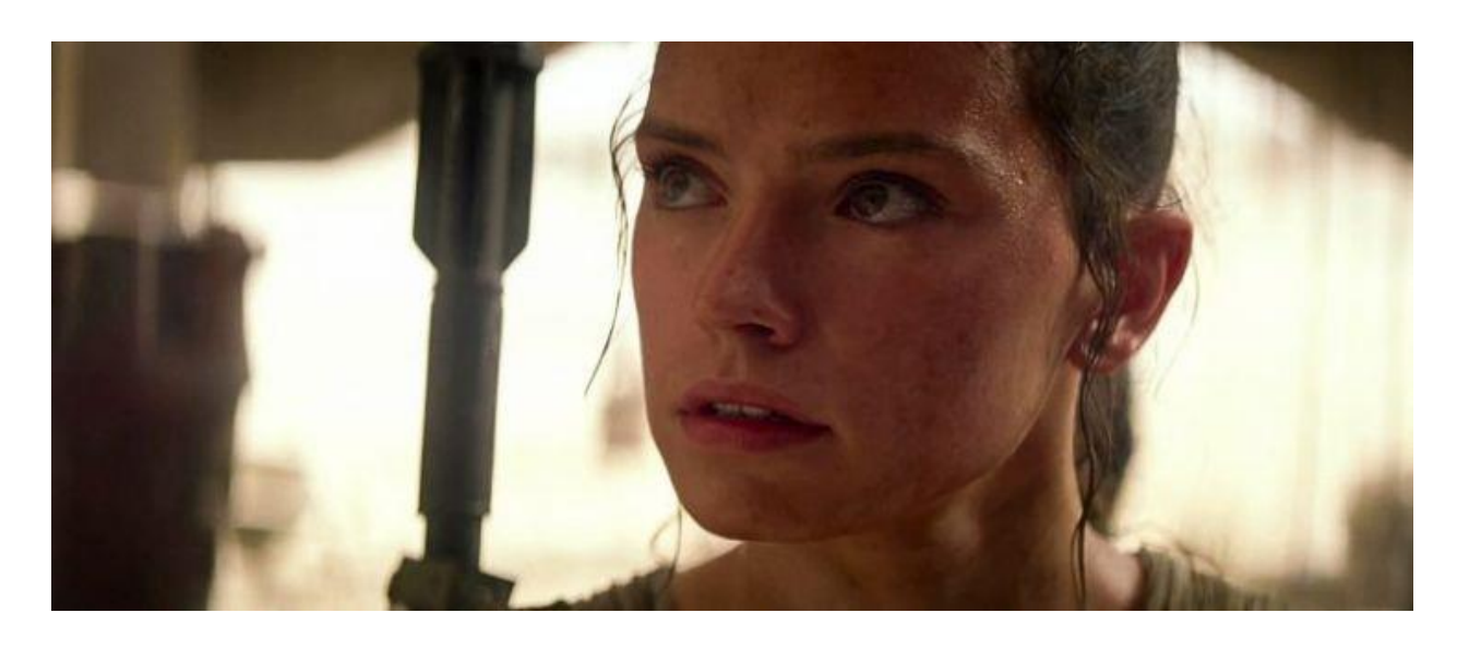
Rey (Daisy Ridley) in Unkar Plutt's shop on Jakku before her awakening. Image screenshot from 00h 13m 33s. All screenshots from The Force Awakens unless otherwise noted.