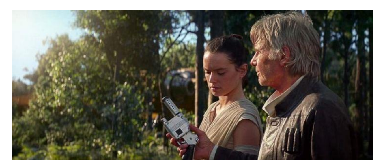
Han Solo (Harrison Ford) gives Rey a blaster for protection. Image screenshot from 00h 55m 33s.